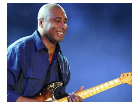
Latin Grammy Nominee & World Series Champion BERNIE WILLIAMS (BM '16)