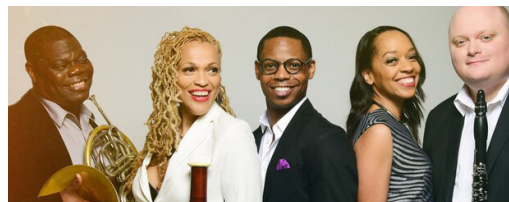
Grammy Award Nominee IMANI WINDS