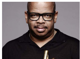
Grammy Award Winner & Oscar Nominee TERENCE BLANCHARD (HonDMA '17)