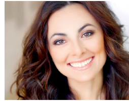
Two-time Grammy Award Winner ISABEL LEONARD Emcee